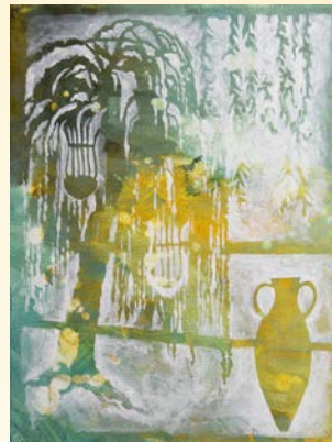
LESSON TWO Lamenting Alone and Together