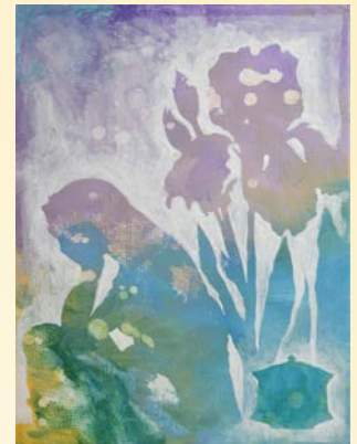
LESSON THREE Women's Lament