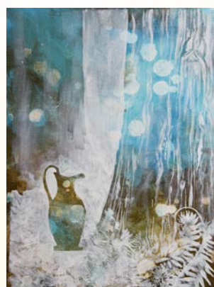
LESSON EIGHT God Laments