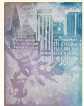
LESSON SIX Lament Over the City