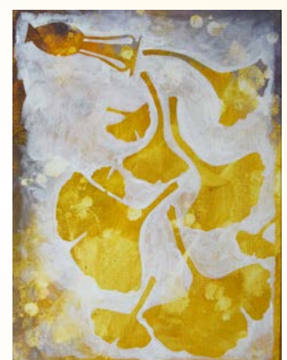
LESSON NINE The End of Lament