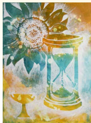
LESSON FIVE Lamenting Life