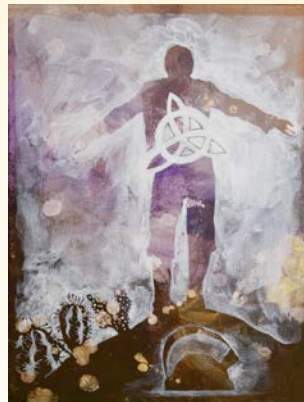
LESSON ONE The Heart of Lament

*Note that prices do not include shipping and handling ($5.91 minimum). International orders and orders to Puerto Rico incur additional shipping charges. Prices, availability, and shipping charges are subject to change without notice.