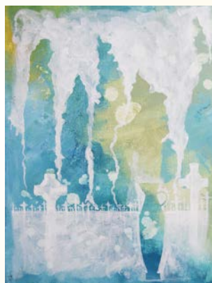
LESSON FOUR Lamenting Death