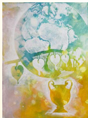
LESSON SEVEN Creation Laments