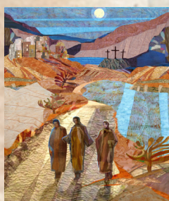
LESSON NINE: When You Are Walking With Jesus: The Road to Emmaus