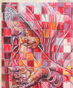
LESSON FIVE: The Gift of the Woman Who Was Poor