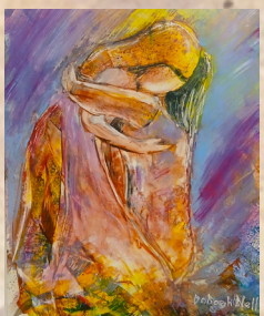
LESSON FOUR: The Prodigal Child, the Eldest Child, and the Devoted Parent