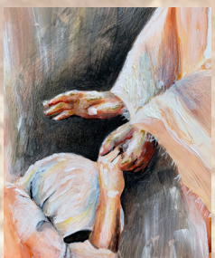
LESSON SEVEN: The Woman Who Was Bent Over