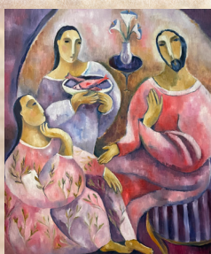
LESSON TWO: Mary "of a Certain Village"