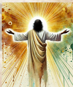
LESSON SIX: Finding Our Joy in Christ: "I Will Say It Again, Rejoice"