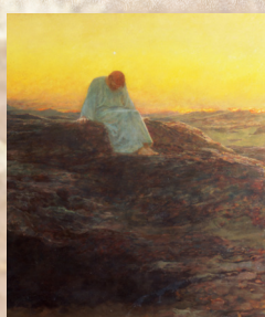
LESSON THREE: Jesus Is Tested